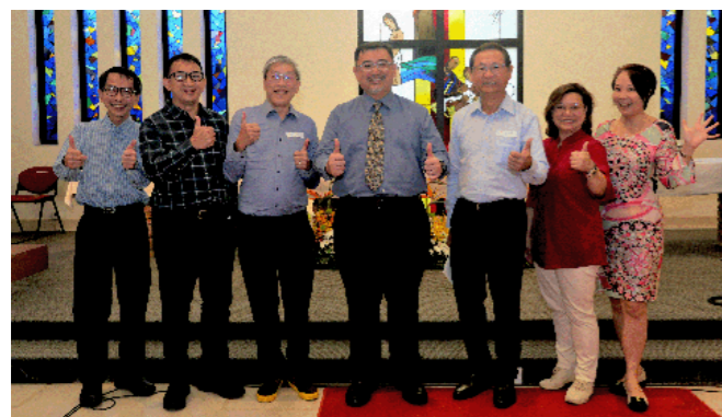
Graduates of our EQUIP certificate and licentiate programmes 2022.