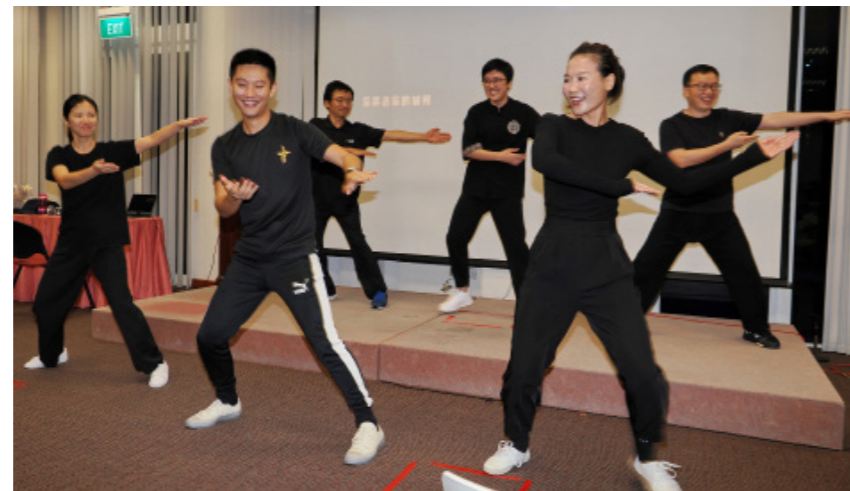
The performance segment brought much laughter and joy.

The TTC Cultural Night returned after a two-year hiatus due to the Covid-19 pandemic. Held on 2 Sep, it was attended by more than 150 participants including faculty, staff, students and their families. This was the first time that most of the current students had the opportunity to experience the event that served to foster a greater sense of community in the TTC body. Students of different cultural background and nationalities enthusiastically served up delicacies unique to their hometowns over dinner, with faculty and staff also chipping in to ensure that no one was left "unfilled". The performance segment by students and even our Dean of Students thereafter brought much laughter and joy. Our hearts were filled with gratitude as we ended the night singing Amazing Grace together in our various tongues, giving thanks to our God who has gathered us into one family as his children. ❖