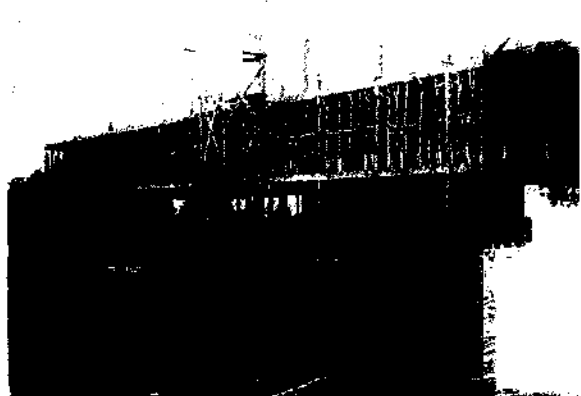
Future home of 100 Chinese orphans