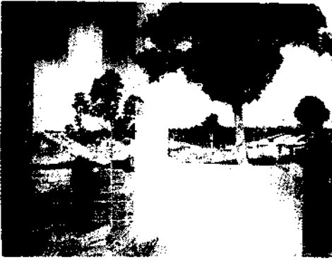
A stark existence...