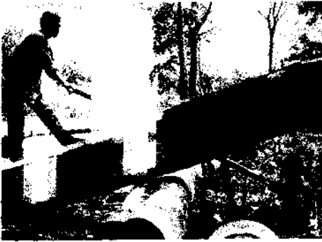
from land cleared and