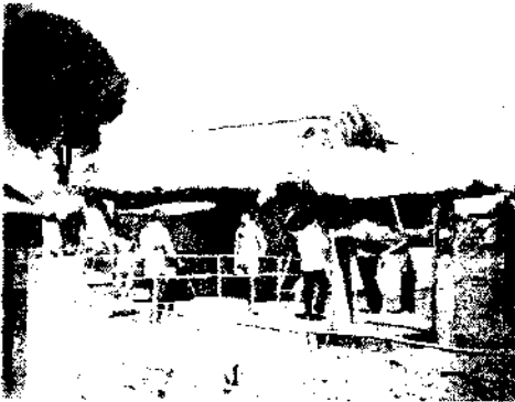
tilled to the doorstep