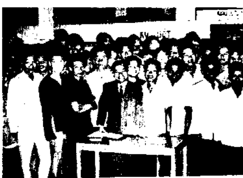
. . . with converts