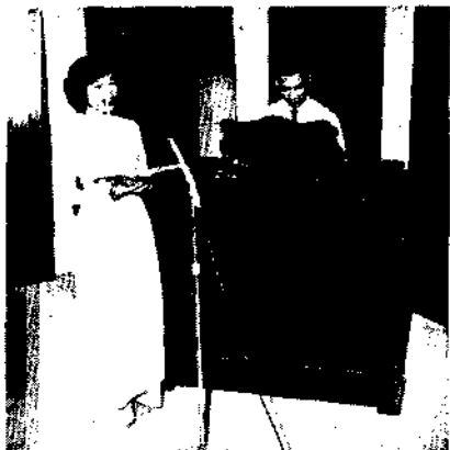
Broadcasting Gospel Music

J UST seven years ago the Gospel radio and recording ministry in Viet Nam was in its infancy. At that time there were three fifteen-minute daily programs through Far East Broadcasting Company facilities in Manila and a half-hour weekly program over a local station. Today, free radio time and public address broadcasts total 21 hours weekly. This is truly a mighty voice, preaching the Gospel on six local radio stations covering nearly all of free Viet Nam in addition to the short wave stations at Manila beamed into both north and south Viet Nam.