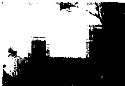
The Gospel Boat

There are many invitations for them to come and preach. Recently, one village which had already been visited once sent a delegation of two to plead for a series of meetings from the Gospel Boat, stating that forty or fifty were ready to pray if