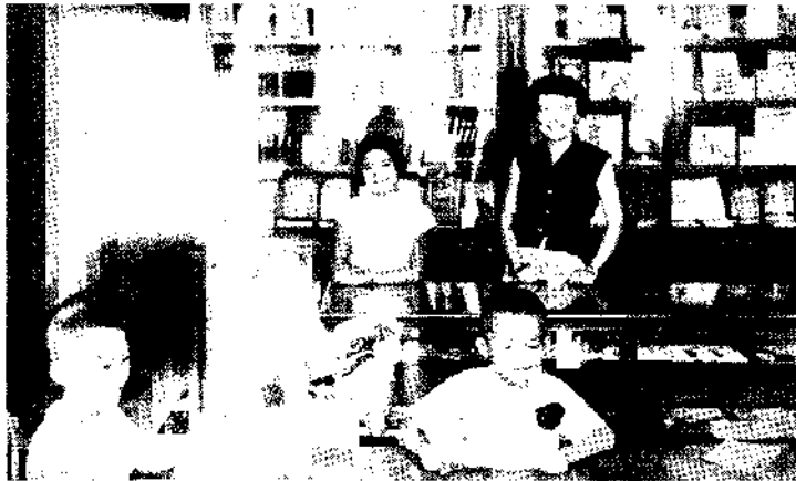
Inside of new Book Room.