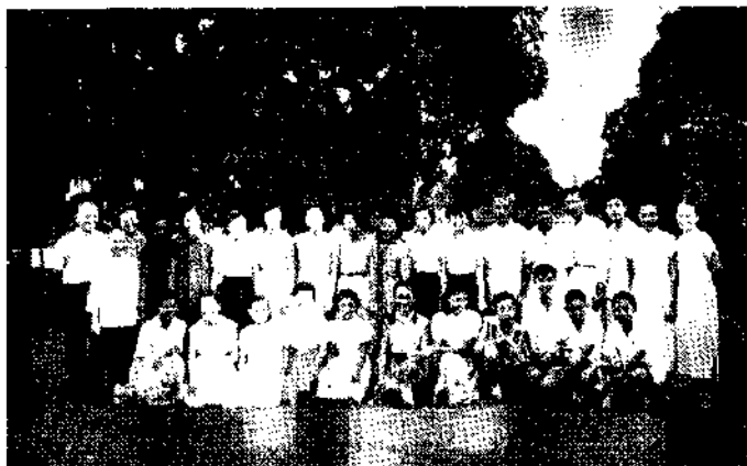
25 chinese christians baptized at Phnom-Penh

a banner day, as twenty-five followed the Lord in the rite of baptism, most of them young people. Pray that they shall be bold witnesses to influence others to renounce that which is vain, and enter into vital relationship with the Lord Jesus Christ. Pray too for the many, many Chinese who live in this country and who are hungry for the Bread of Life.