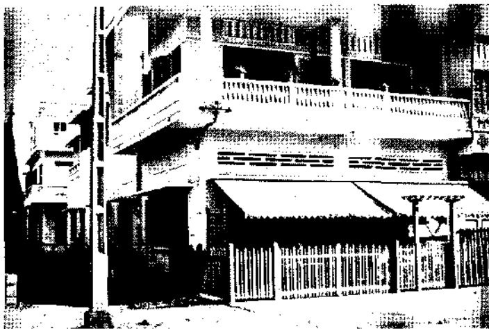
Saigon Gospel Press and Residence