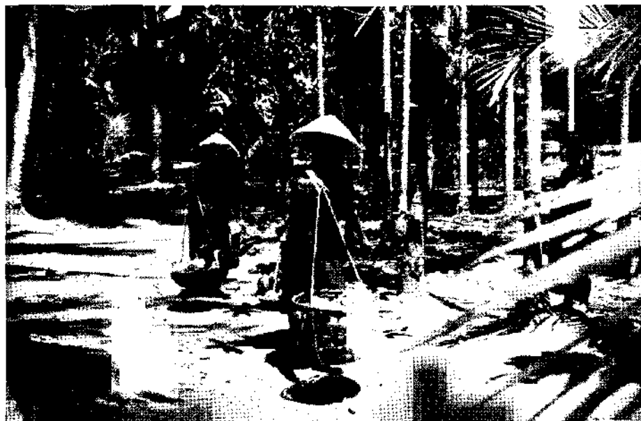
Vietnamese Women Returning From Market